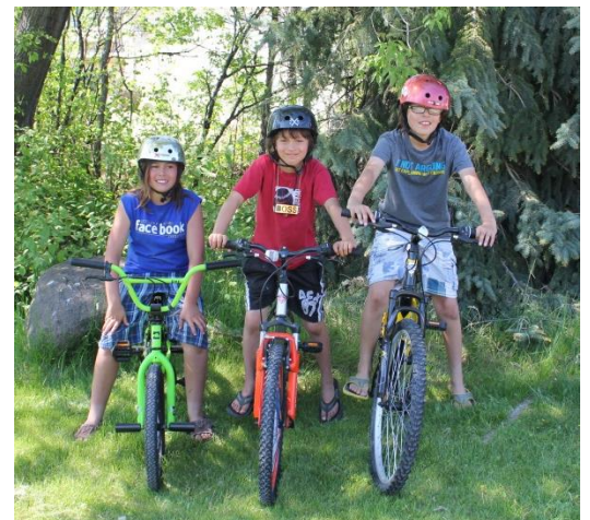
Thanks to Canadian Tire Jumpstart, 31 ROC kids received brand new bikes and summer adventure!